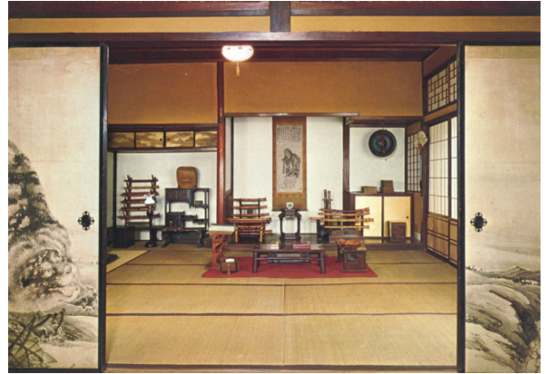
A practice room!

[Ed] These are nicely presented in a ring binder format with Kinko scores at one end and western notation at the other end of the book. The kinko scores are paged from the back of the book right to left whilst the western scores are at the front of the book paged left to right.