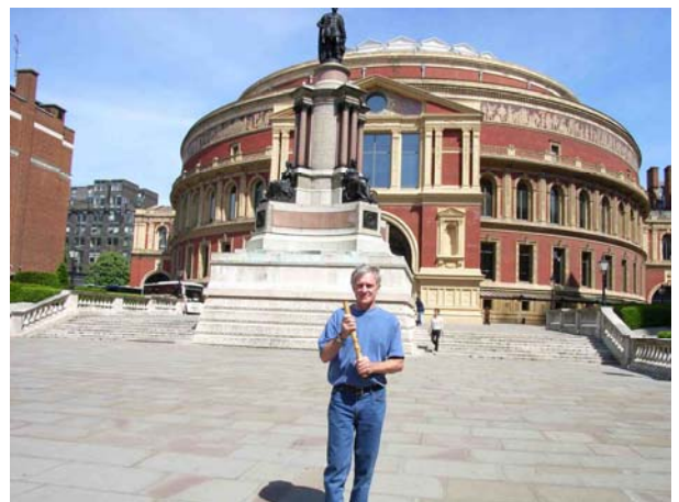
Lurking outside Albert Hall in London