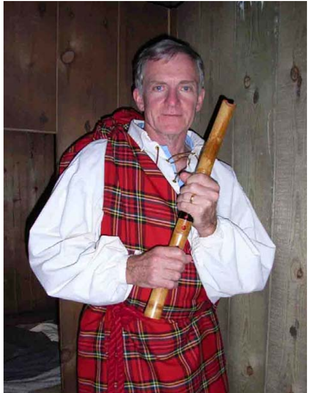
Holding a Bass Shakuchanter .....