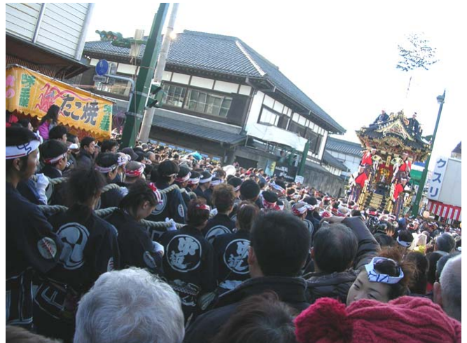
After sake - photographer?

That moss garden is probably the most beautiful one in Japan, this photo is just one part of it. Apparently the layout of the lake forms the kanji for heart. The entire garden is beautiful.