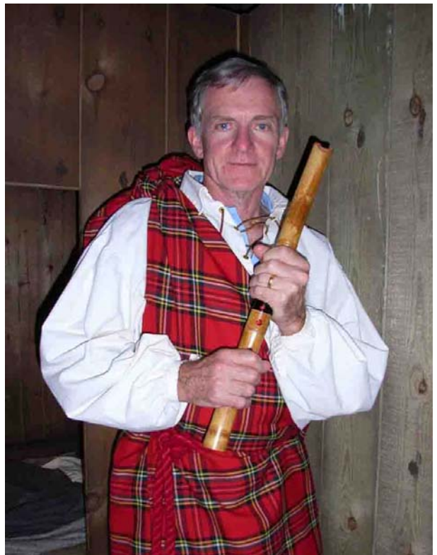
Holding a Bass Shakuchanter .....